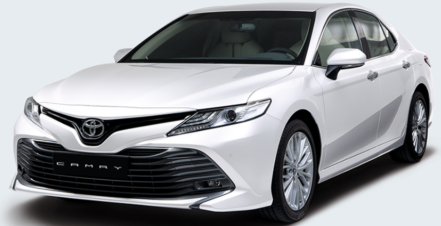
PLATINUM WHITE PEARL MICA