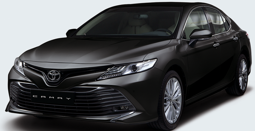
ATTITUDE BLACK MICA