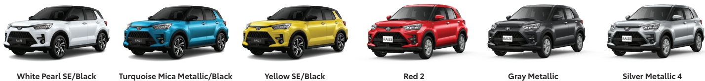
White Pearl SE/Black